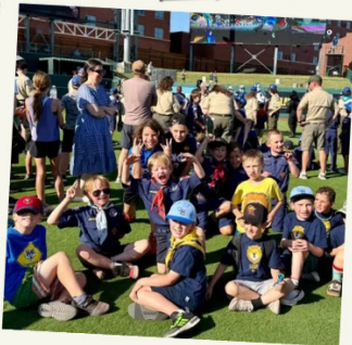
Pack 120 enjoyed Scout Night with the OKC Comets!