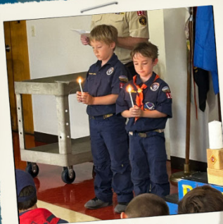
Congrats to our 2 nd grade Tigers - we're excited to see what you achieve in the Wolf Den!