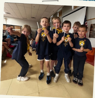
Kindergarten Lion Scouts are moving up the Tiger Den!