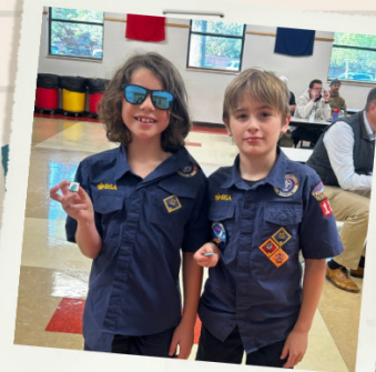
Congrats to 3rd grade Bear Scouts on their advancement to the Webelo rank!