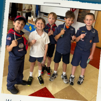
Way to go, Wolves! Our 2nd graders are advancing to the Bear Den - keep up the amazing work!