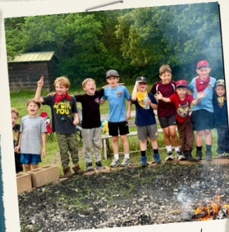
Pack 120 Cub Scouts enjoyed the great outdoors at Camp John Nichols!